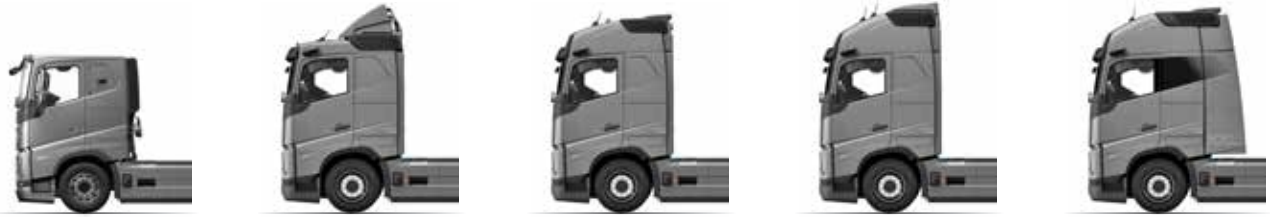
Low sleeper cab